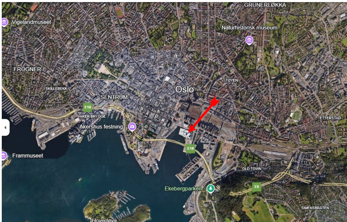
The rectangular white Italian marble building, the Norwegian Opera House, stands out clearly as seen from a satellite.