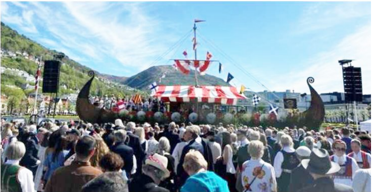
Residents of Bergen, Norway gather to celebrate Syttende Mai.

Every year at Easter, something quite special happens in Norway: they don't just go skiing – they read crime stories. This tradition, known as påskekrim (Easter crime), has been around for over a hundred years, filling bookshelves, TV screens, and podcasts with mysteries, murders, and dark tales throughout the holiday.