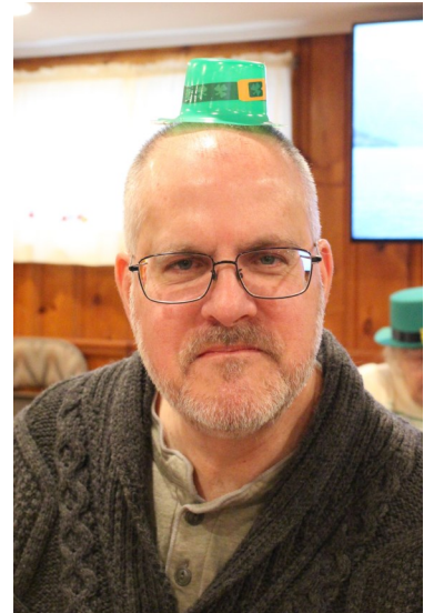
Dressed for St Pat's in a big way . . . and in a wee way.