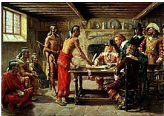
Jonas Bronck signs a treaty with the local indians

Jonas Bronck (around 1600 – 1643) was a settler from Scandinavia, probably Sweden, in the Dutch colony of New Netherland after whom the Bronx River, and by extension, the county and New York City borough of the Bronx are named.