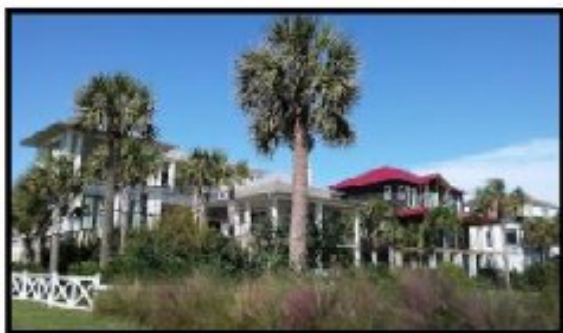
COVERED BACK DECK – PERFECT AREA FOR RELAXING, QUIET TIME OR MEETING SPACE