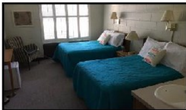
DOUBLE ROOMS—SLEEPS UP TO 4 PEOPLE PER ROOM. 10 AVAILABLE.