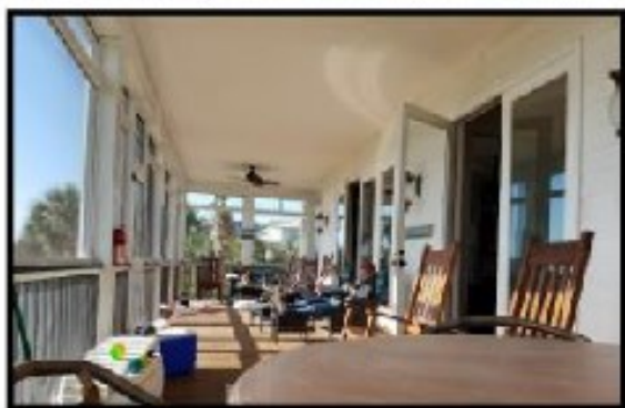
MULTIPLE MEETING/GATHERING ROOMS