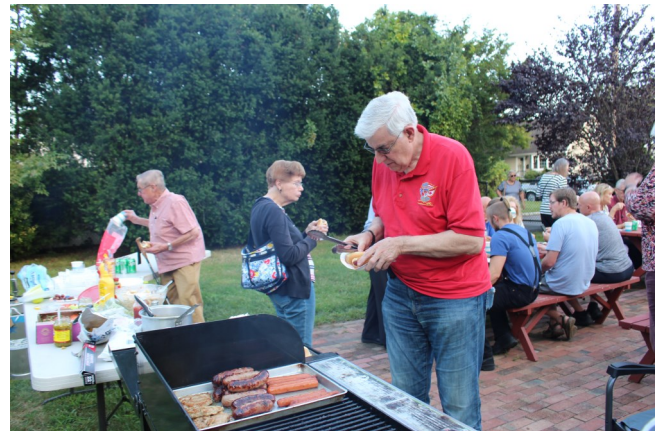
A fine evening at Norway Hall with lots of good friends and lots of good food.